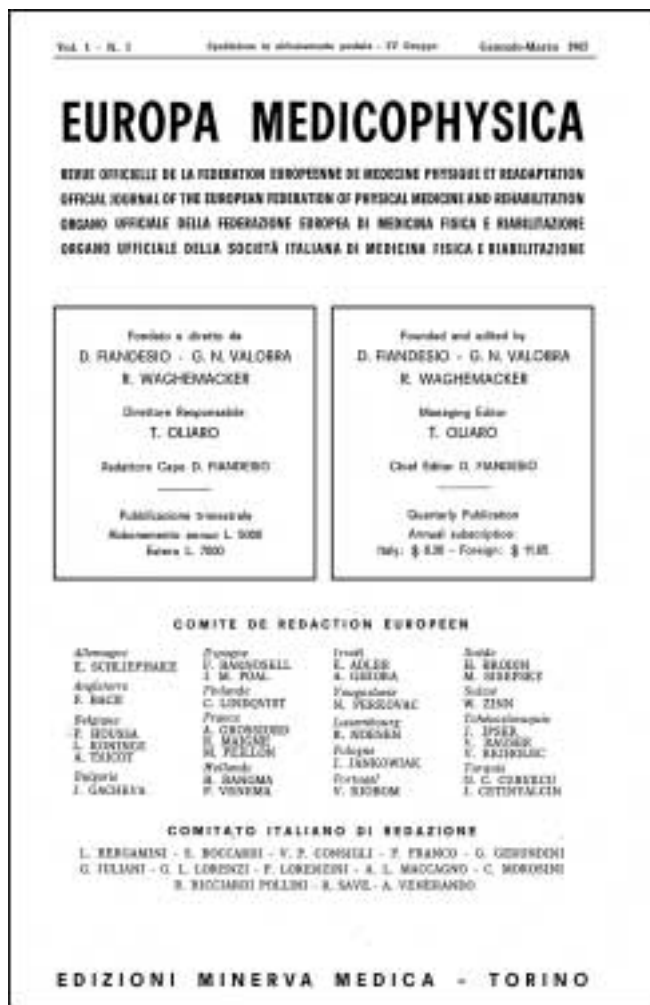
Figure 2.—Editorial board published in the first issue of the Journal.