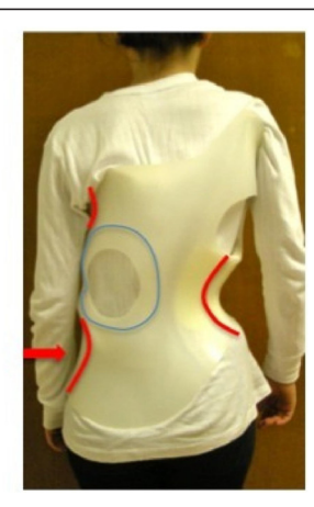
Fig. 5 SPORT (Sforzesco) Brace (left), ART Brace (middle), Rigo-Cheneau Brace (Right). The differences in the level of symmetry and asymmetry is evident

to respond to any corrective action applying the PASB brace in curves larger than 45° [29]. The anatomical modifications of the disc, caused by a permanent rotation greater than 20 Perdriolle degrees, are characterized by hysteresis of the fibers of the annulus. This leads to an increase of the module of the torsional stiffness and this could make the disc indifferent to the derotation action of any type of brace, but we don't have enough data to be sure about and it is possible that the super-rigid material could overcome this limit.